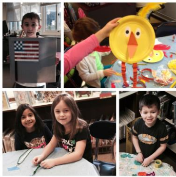
We may be cooped up inside, but we're having tons of fun while waiting for the sun! Indoor fun at Andrew Muller Primary School SACC Miller Place