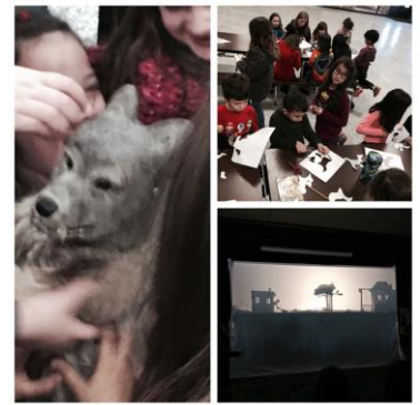
We watched an amazing show then learned to make our own shadow puppets! Marionette & Shadow Puppet Event, Little Feet Puppet Theatre