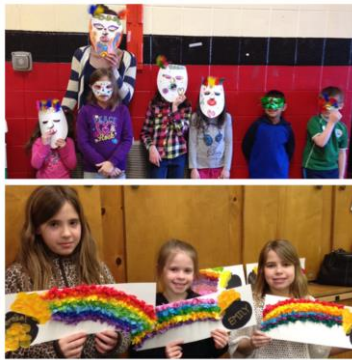
Happy holidays! We love to celebrate! Mardi Gras Masks and Magical Rainbows at Miller Avenue SACC Shoreham-Wading River