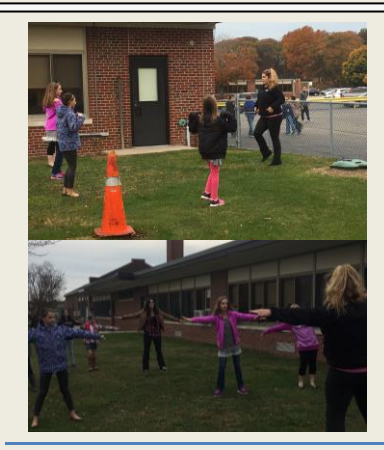
Zumba at JAE