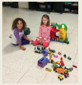
Play time at Miller Avenue Elementary