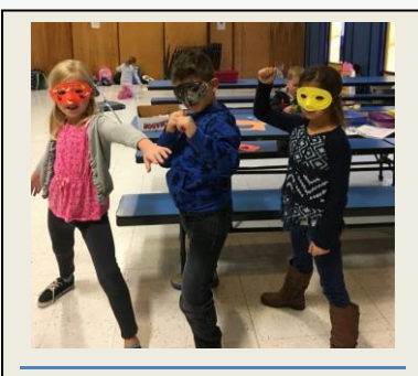
Masked Children of Aftercare at Miller Avenue