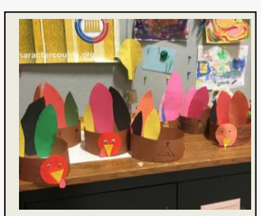
Gobble! Gobble! Turkey hats from Miller Avenue

Fun Times at North Shore Youth Council's School-Aged Child Care